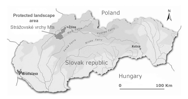
Figure 1. Location of the study area in relation to the distribution of the Western Carpathian population of brown bears.

Seven microsatellite loci Mu26, Mu64, G10B, G1D, G10L, Mu50 and Mu51 were amplified using poly-